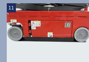
11 Anti-overturning system: When the machine raises to more than 6.5ft, this system will work automatically, to protect the machine from overturning while walking at un-leveling ground.