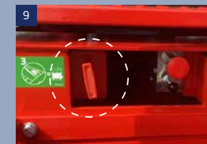
9 Manual lowering valve: When the operation system failed or the battery power is too low to let the platform decline, we can use this valve to lower the machine