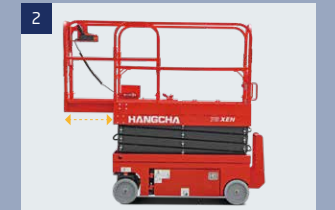
2 Extension platform