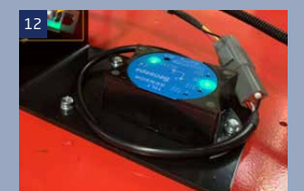
12 Angle sensor: when it is lifting and walking on the slope, the sensor will automatically judge the status of the machine, if the angle is larger than the rated angle, it will alarm to remind the operator.