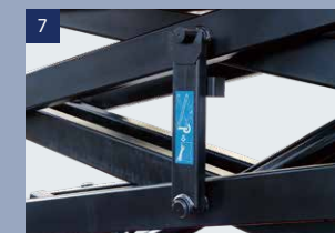
7 Supporting arms: To protect the operator when he is doing repair or maintenance job