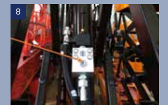
8 Explosion proof valve: To prevent the machine falling when the oil pipe is leaking