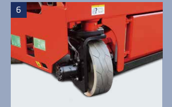
6 Traction motor