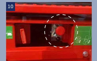
10 Manual release valve: When the machine can not move, you can push the machine after pressing this valve